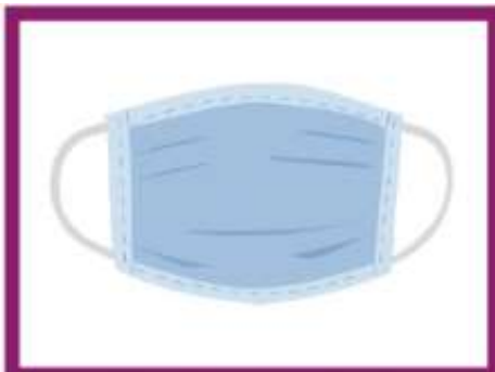
WEAR MASKS IN COMMON AREAS