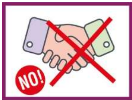
DO NOT SHAKE HANDS