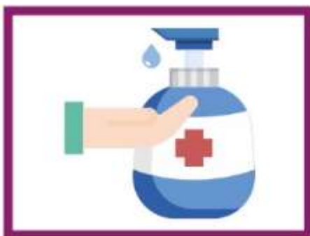
USE HAND SANITIZER GEL