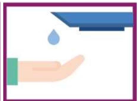
WASH YOUR HANDS REGULARLY